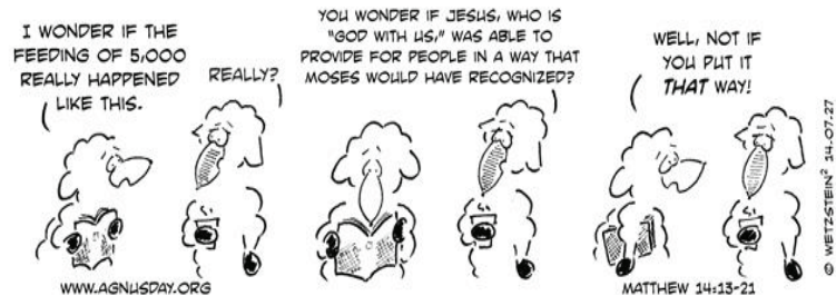
Agnus Day appears with the permission of www.agnusday.org